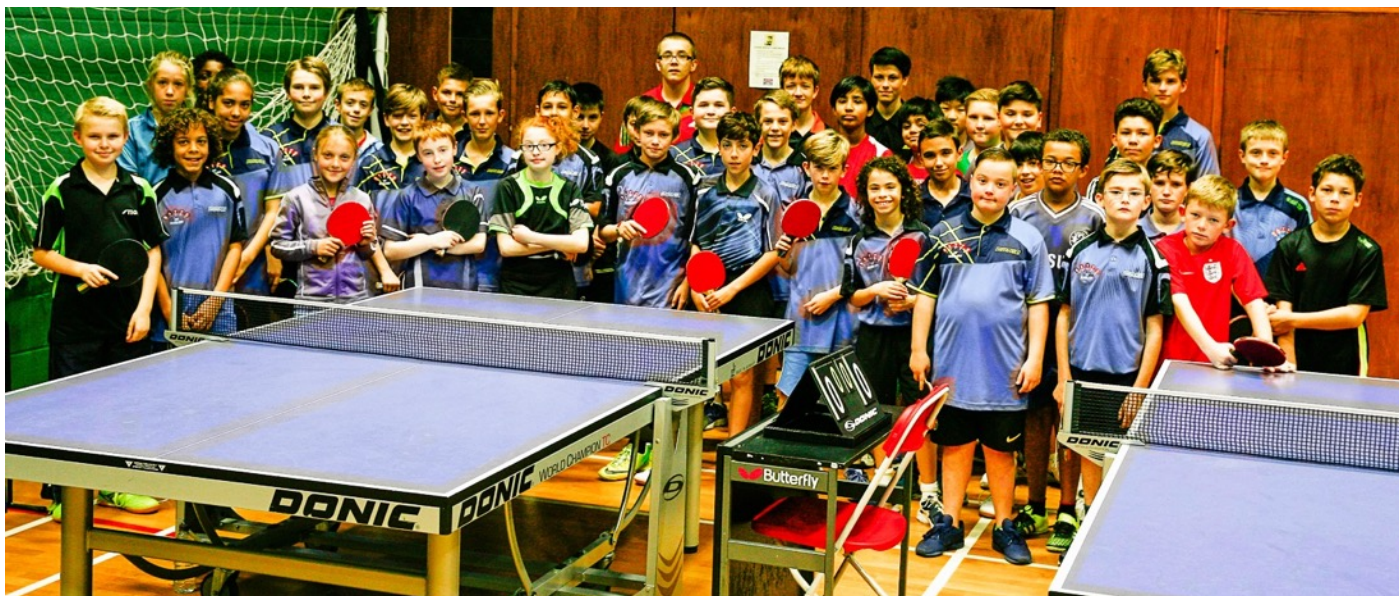
Ready for action at the start of the second round of matches on Saturday 17th October